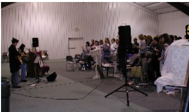
Owned by the Baptist Convention of New Mexico and supported by New Mexico Southern Baptist churches.

***Groups under 100 are not guaranteed exclusive use of the facility.